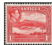
Nelson's Dockyard — A15