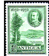
Old Dockyard, English Harbour — A8