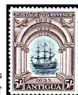
Sir Thomas Warner's Ship, 1632 — A11