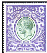
George V — A6

Nos. 33, 35-38 are on chalky paper. For overprints see Nos. MR1-MR3.