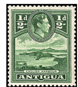
English Harbour — A14