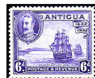
Nelson's "Victory," 1805 — A10