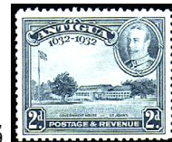
Govt. House, St. John's — A9