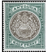
Seal of the Colony — A3