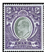
King Edward VII — A4