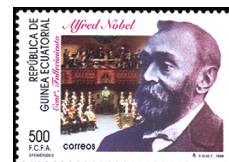
Famous People A79

1996 Litho. Perf. 14 216 Strip of 4, #a.-d. 6.50 6.50 a.-d. A78 350fr Any single 1.00 1.00