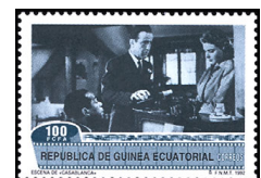
Motion Pictures, Cent. A61a

1992, Apr. 8 172 A61 Sheet of 2, #a.-b. 11.00 9.50