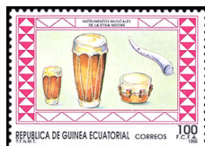
Musical Instruments of the Ndwé People — A52

1990, June 8 Litho. Perf. 13 143 A51 100fr Soccer player, map .50 .35 144 A51 250fr Goalkeeper 1.00 .65 145 A51 350fr Trophy 1.50 1.00 Nos. 143-145 (3) 3.00 2.00