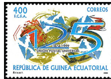
UPU, 125th Anniv. (in 1999) A96

2000 239 Horiz. strip of 4 4.50 4.50 a.-d. A95 400fr Any single 1.10 1.10