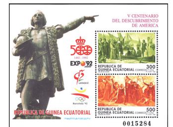
Discovery of America, 500th Anniv. — A61

Columbus: a, 300fr, Departing from Palos, Spain. b, 500fr, Landing in New World.