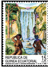
Youths Bathing, Ilachi Falls — A47

1989, Apr. 14 Litho. Perf. 14 129 A46 10fr multicolored .20 .20 130 A46 35fr multicolored .25 .20 131 A46 45fr multicolored .30 .20 Nos. 129-131 (3) .75 .60