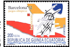
1992 Summer Olympics, Barcelona A60

1992, Feb. 12 Litho. Perf. 13½x14 169 A60 200fr Basketball 1.00 .75 170 A60 300fr Swimming 1.50 1.10