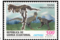
Prehistoric Animals A100

2001 Litho. Perf. 14x13% 243 Horiz. strip of 4 4.50 4.50 a.-d. A99 400fr Any single 1.10 1.10