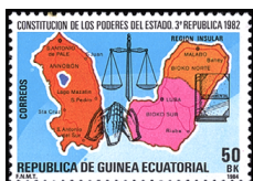
Constitution of State Powers — A25

Scales of justice, fundamental lawbook and various maps.