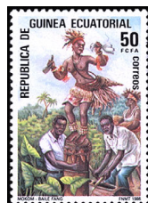
Folklore — A34