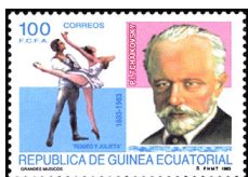
Scene from Romeo and Juliet, by Tchaikovsky — A65

1993 Litho. Perf. 13 1/2 x 14 179 A64 100fr multicolored .50 .35 180 A64 250fr multicolored 1.10 .75 181 A64 350fr multicolored 1.50 1.00 182 A64 400fr multicolored 1.75 1.25 Nos. 179-182 (4) 4.85 3.35