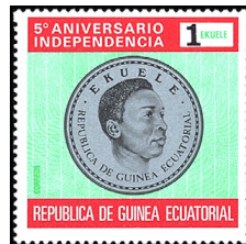
Natl. Independence, 5th Anniv. (in 1973) — A7

Christmas, Titian painting, "The Virgin," airmail souv. sheet, 150e, issued Aug. Nos. 7892.