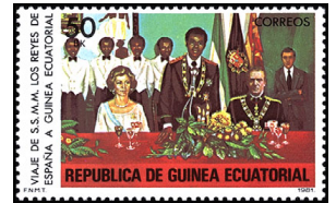
State Visit of King Juan Carlos of Spain — A16

1981, Aug. 30 Litho. Imperf. 46 A15 400b multi 3.00 2.25