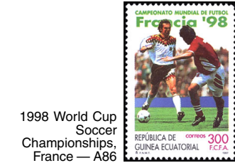
1998 World Cup Soccer Championships, France — A86

1997 224 Strip of 4, #a.-d. 7.50 7.50 a.-d. A85 400fr Any single 1.10 1.10