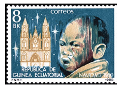
Christmas 1980 A14

1981, Mar. Photo. Perf. 13½x12½ 38 A12 5b Obiang Esono Nguema .20 .20 39 A12 15b Fernando Nvara Engonga .20 .20 40 A12 25b Ela Edjodjomo Mangue .20 .20 41 A12 35b Obiang Nguema Moasogo, president .25 .20 42 A12 50b Hipolito Micha Eworo .35 .20 43 A13 100b multi .70 .35 Nos. 38-43 (6) 1.90 1.35 Dated 1980.