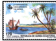
Discovery of America, 500th Anniv. (in 1992) A53

1990, Oct. 10 149 A53 170fr Arrival in New World .60 .35 150 A53 300fr Columbus' fleet 1.00 .55