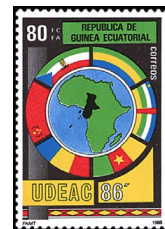
Conf. of the Union of Central African States — A37