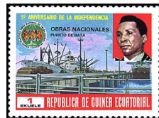
Natl. Independence, 5th Anniv. (in 1973) — A8

1979 27 A8 1e Port Bata .35 .25 28 A8 1.50e State Palace .50 .35 29 A8 2b Central Bank, Bata .65 .45 30 A8 2.50b Nguema Bijogo Bridge .80 .60 31 A8 3b Port, palace, bank, bridge 1.00 .65 Nos. 27-31 (5) 3.30 2.30