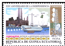
25th Anniv. of Independence — A67

1993 Perf. 13 1/2 x 14, 14 x 13 1/2 185 A66 200fr First Ford vehicle 2.00 1.00 186 A66 300fr Ford Model T 3.25 1.50 187 A66 400fr Henry Ford, vert. 4.50 2.10 Nos. 185-187 (3) 9.75 4.60