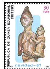
Christmas 1987 — A41