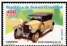
Automobiles — A103

No. 251: a, 1924 Rochet Schneider 20,000, b, 1930 Bugatti T49, c, 1931 Ford Model A, d, 1925 Alfa Romeo RLSS.