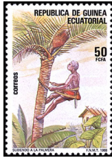
Climbing Palm Tree — A42