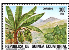
Banana Trees A23