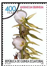
Orchids — A91

232 Strip of 3, #a.-c. 7.00 7.00 a.-c. A90 500fr Any single 1.25 1.25