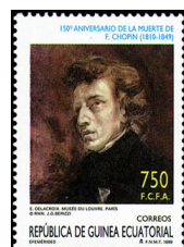
Birth and Death Anniversaries A92

1999 233 Strip of 4, #a.-d. 7.00 7.00 a.-d. A91 400fr Any single 1.00 1.00