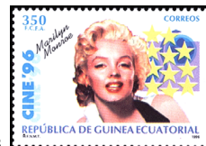
Motion Pictures, Cent. A78

1995 Litho. Perf. 14 215 Strip of 4, #a.-d. 7.00 7.00 a.-d. A77 400fr Any single 1.00 1.00