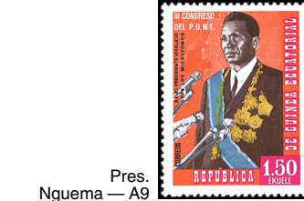
Pres. Nguema — A9

1979 27 A8 1e Port Bata .35 .25 28 A8 1.50e State Palace .50 .35 29 A8 2b Central Bank, Bata .65 .45 30 A8 2.50b Nguema Bijogo Bridge .80 .60 31 A8 3b Port, palace, bank, bridge 1.00 .65 Nos. 27-31 (5) 3.30 2.30