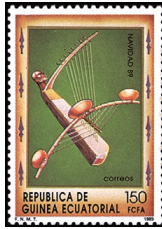
Christmas — A49

1989, Oct. 23 Litho. Perf. 13½ 135 A48 25fr shown .25 .20 136 A48 35fr Torch, vert. .35 .20 137 A48 40fr Pres. Nguema, vert. .40 .20 Nos. 135-137 (3) 1.00 .60