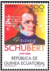
Franz Schubert (1797-1828), Composer — A83

1996 221 Strip of 3, #a.-c. 7.50 7.50 a.-c. A82 500fr Any single 1.25 1.25