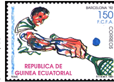
1992 Summer Olympics, Barcelona A55

1990, Dec. 23 Litho. Perf. 13½ 151 A54 170fr shown .60 .45 152 A54 300fr Bubi tribesman 1.00 .75