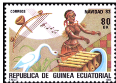
Christmas 1983 A24