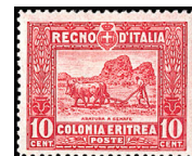
Farmer Plowing — A4