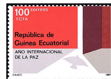
Intl. Peace Year A39