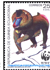
Madrillex Sphinx — A57

1991, May 6 Litho. Perf. 14 156 A56 100fr shown 1.00 .50 157 A56 250fr multicolored 2.25 1.10 158 A56 350fr multicolored 3.00 1.50 Nos. 156-158 (3) 6.25 3.10