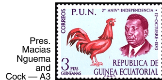
Pres. Macias Nguema and Cock — A3