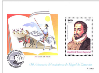
Miguel de Cervantes (1547-1616), Novelist — A84

Designs: a, shown. b, Chinese Lunar New Year, 1997, (Year of the Ox). c, Johannes Brahms (1833-97), composer. Illustration A84 reduced.