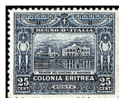
Government Building at Massaua — A2