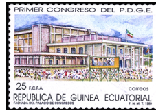
1st Congress of the Democratic Party of Equatorial Guinea A48

1989, July 7 Perf. 13½ 132 A47 15fr shown .20 .20 133 A47 25fr multicolored .20 .20 134 A47 60fr multicolored .40 .25 Nos. 132-134 (3) .80 .65