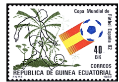
1982 World Cup Soccer Championships, Spain — A19

1982, Feb. 25 Photo. 53 A18 100b Carolers, vert. .75 .35 54 A18 150b Magi, African youth 1.10 .60 Dated 1981.