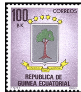
Natl. Coat of Arms — A13

1981, Mar. Photo. Perf. 13½x12½ 38 A12 5b Obiang Esono Nguema .20 .20 39 A12 15b Fernando Nvara Engonga .20 .20 40 A12 25b Ela Edjodjomo Mangue .20 .20 41 A12 35b Obiang Nguema Moasogo, president .25 .20 42 A12 50b Hipolito Micha Eworo .35 .20 43 A13 100b multi .70 .35 Nos. 38-43 (6) 1.90 1.35 Dated 1980.