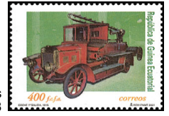
Fire Trucks A98

2001 Litho. Perf. 13% 241 Horiz. strip of 4 4.50 4.50 a.-d. A97 400fr Any single 1.10 1.10