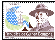
Boy Scouts A50

1989, Dec. 18 Litho. Perf. 13½ 138 A49 150fr shown 1.25 .75 139 A49 300fr Nativity, horiz. 1.50 1.00