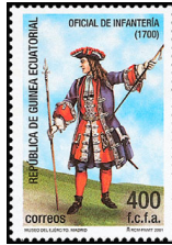
Soldiers — A99

2001 242 Horiz. strip of 4 4.50 4.50 a.-d. A98 400fr Any single 1.10 1.10