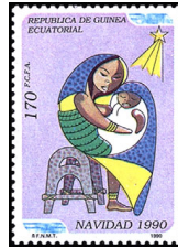
Christmas — A54

1990, Oct. 10 149 A53 170fr Arrival in New World .60 .35 150 A53 300fr Columbus' fleet 1.00 .55