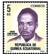
Independence Martyrs — A12

1979 Perf. 13x13½ 36 A11 1e multi .35 .25 37 A11 1.50e multi, diff. .50 .35