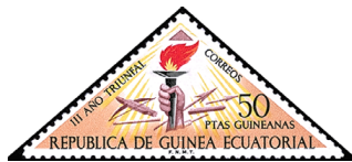
Torch, Bow and Arrows — A4

2nd anniv. of independence, Oct. 12, 1970.