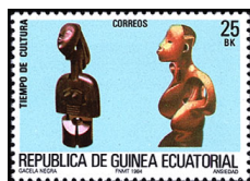
Abstract Wood-Carved Figurines and Art — A28

Designs: 25b, Black Gazelle and Anxiety , 30b, Black Gazelle , diff., and Woman . 60b, Man and woman , vert. 75b, Poster , vert. 100b, Mother and Child , vert. 150b, Man and Woman , diff., and Bust of a Woman .