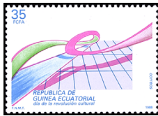
Cultural Revolution Day — A44

1988, Nov. 16 121 A43 40fr Crest .30 .20 122 A43 75fr Torch, motto, horiz. .50 .30 123 A43 100fr Torch, flag, weaving, horiz. .75 .40 Nos. 121-123 (3) 1.55 .90