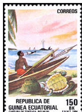
Turtle Hunting, Rio Muni — A26