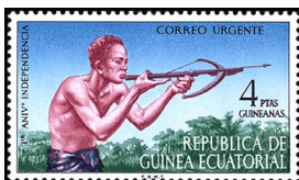
Archer with Crossbow — SD1