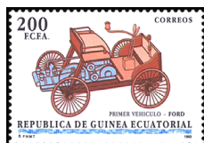
First Ford Gasoline Engine, Cent. A66

1993, June Litho. Perf. 13 1/2 x 14 183 A65 100fr multicolored .50 .40 184 A65 200fr multicolored .90 .75