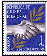
Clasped Hands and Laurel — A1

Catalogue values for all unused stamps in this country are for Never Hinged items.