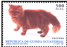
Domestic Animals A73

1994 Litho. Perf. 13 1/2 x 14 206 A72 300fr Aurichalcite 1.90 1.00 207 A72 400fr Pyromorphite 2.40 1.40 208 A72 600fr Fluorite 3.50 1.90 209 A72 700fr Halite 4.00 2.25 Nos. 206-209 (4) 11.80 6.55