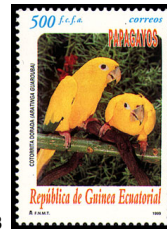
Parrots — A93

1999 Litho. Perf. 14x13% 234 Horiz. strip of 4, #a.-d. 7.00 7.00 a. A92 750fr multi 2.00 2.00 b. A92 100fr multi .25 .25 c. A92 250fr multi .75 .75 d. A92 500fr multi 1.40 1.40