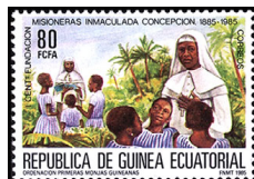
Immaculate Conception Missions, Cent. — A30

50fr, Emblem, vert. 60fr, Map, nun and youths, vert. 80fr, First Guinean nuns. 125fr, Missionaries landing at Bata Beach, 1885.