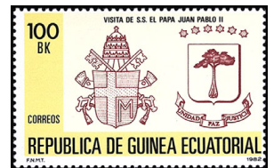
State Visit of Pope John Paul II — A17

1981, Nov. 30 47 A16 50b Government reception .50 .20 48 A16 100b Arrival at airport .95 .35 49 A16 150b King, Pres. Mbasogo, vert. 1.40 .60 Nos. 47-49 (3) 2.85 1.15