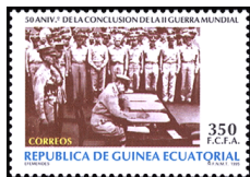
Anniversaries — A75

1995 211 Strip of 4, #a.-d. 6.00 6.00 a.-d. A74 400fr Any single 1.00 1.00