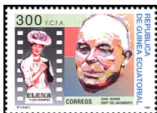
Famous Men A71

Designs: 300fr, Jean Renoir (1894-1979), French film director. 500fr, Ferdinand de Lesseps (1805-94), French diplomat, promoter of Suez Canal. 600fr, Antoine de Saint Exupery (1900-44), French aviator, writer. 700fr, Walter Gropius (1883-1969), architect.