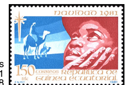
Christmas 1981 A18

1982, Feb. 18 50 A17 100b Papal and natl. arms 1.25 .70 51 A17 200b Pres. Mbasogo greeting Pope 2.40 1.40 52 A17 300b Pope, vert. 3.50 2.10 Nos. 50-52 (3) 7.15 4.20