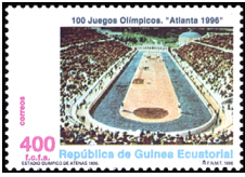
1996 Summer Olympic Games, Atlanta A81

Designs: a, Olympic Stadium, Athens, 1896. b, Cycling. c, Tennis. d, Equestrian show jumping.