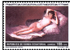
La Maja Desnuda by Goya A56

Designs: 250fr, Eve by Durer, vert. 350fr, The Three Graces by Rubens, vert.