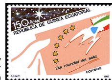
Stamp Day 1987 A40