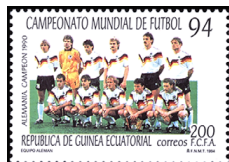
1994 World Cup Soccer Championships, US — A68

Perf. 14 x 13 1/2, 13 1/2 x 14 1993, Oct. 12 Litho. 188 A67 150fr multicolored .75 .50 189 A67 250fr multicolored 1.10 .75 190 A67 300fr multicolored 1.40 1.00 191 A67 350fr multicolored 1.50 1.10 Nos. 188-191 (4) 4.75 3.35