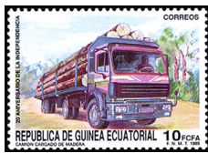
Natl. Independence, 20th Anniv. — A46

1988, Dec. 22 127 A45 50fr shown .30 .20 128 A45 100fr Mother and child .70 .40