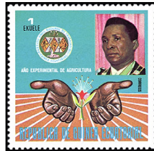
Agricultural Experiment Year A11

1979 33 A10 1e Enrique Nvo .35 .20 34 A10 1.50e Salvador Ndongo Ekang .50 .35 35 A10 2b Acacio Mane .65 .45 Nos. 33-35 (3) 1.50 1.00