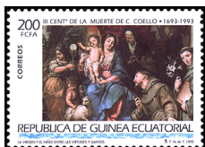
Virgin and Child with Virtuous Saints, by Claudio Coello (c. 1635-1693) — A63

Paintings, by Jacob Jordaens (1593-1678): 300fr, Apollo Conquering Marsias. 400fr, Mel-eager and Atalanta.