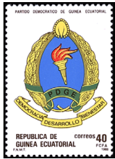
Democratic Party — A43

1988, May 4 Litho. Perf. 13½ 118 A42 50fr shown .40 .20 119 A42 75fr Woman carrying fish .50 .30 120 A42 150fr Chopping down trees 1.00 .60 Nos. 118-120 (3) 1.90 1.10