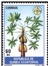
World Food Day — A27