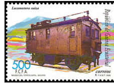
Locomotives — A94

No. 237: a, Swiss. b, German. c, Japanese.