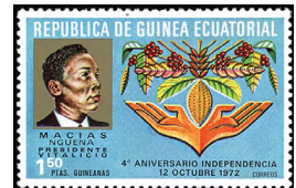
Natl. Independence, 4th Anniv. — A6

Pres. Macias Nguema and: 1.50p, Agriculture. 2p, 4p, Education. 3p, 5p, Natl. defense.