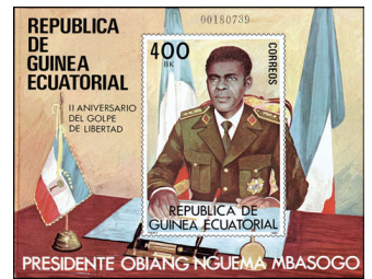
Pres. Obiang Nguema Mbasogo — A15

1981, Aug. 30 Litho. Imperf. 46 A15 400b multi 3.00 2.25