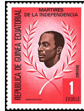
Independence Martyrs — A10

1979 Perf. 13½x13 32 A9 1.50e multi .50 .35