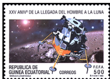
First Manned Moon Landing, 25th Anniv. A69

1994 Litho. Perf. 13 1/2 x 14, 14 x 13 1/2 192 A68 200fr multicolored .70 .45 193 A68 300fr multicolored 1.00 .65 194 A68 500fr multicolored 1.75 1.10 Nos. 192-194 (3) 3.45 2.20