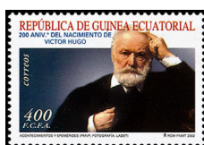
Famous Men A105

2002 252 Strip of 4 5.25 5.25 a-d. A104 400fr Any single 1.25 1.25