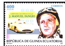
Formula 1 Driving Champions A77

Designs: a, Juan Manuel Fangio. b, Ayrton Senna. c, Jim Clark. d, Jochen Rindt.