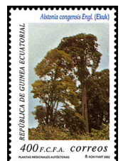
Flora — A102

No. 250: a, Alstonia congensis. b, Harongana madagascariensis. c, Caloncoba glauca. d, Cassia occidentalis.