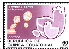
Campaign Against Hunger A38