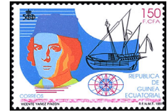
Discovery of America, 500th Anniv. A58

Captains, ships: 150fr, Vicente Yanez Pinzon, Nina. 260fr, Martin Alonso Pinzon, Pinta. 350fr, Christopher Columbus, Santa Maria.