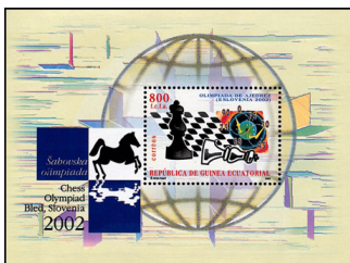
2002 Chess Olympiad, Bled, Slovenia — A107