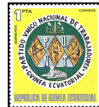
United Natl. Workers' Party Emblem — A5

American and Russian Astronaut Memorial, set of seven, 1p, 3p, 5p, 8p, 10p, airmail 15p, 25p, plus two airmail semi-postal souv. sheets, perf. 200p+25p, imperf. 250p+50p, and four gold foil ovptd. "Apollo 16 and 17" perf. 200p+25p (2), imperf. 250p+50p (2), issued Dec. 14. Nos. 72235-72247.