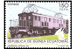
Locomotives — A59

1991 Litho. Perf. 13½x14 163 A58 150fr multicolored .65 .40 164 A58 250fr multicolored 1.10 .75 165 A58 350fr multicolored 1.60 1.25 Nos. 163-165 (3) 3.35 2.40