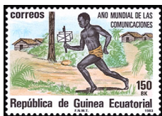
World Communications Year — A22