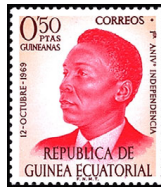
Pres. Francisco Macias Nguema — A2