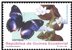
Butterflies & Orchids A74

1995 Litho. Perf. 13 1/2 x 14 210 Strip of 3, #a.-c. 6.00 6.00 a.-c. A73 500fr Any single 1.25 1.25