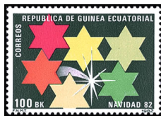
Christmas 1982 A21