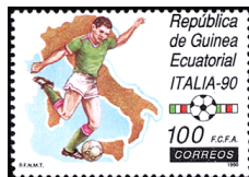
World Cup Soccer Championships, Italy — A51

1990, Mar. 23 Litho. Perf. 13 140 A50 100fr Lord Baden-Powell .90 .50 141 A50 250fr Salute 2.10 1.10 142 A50 350fr Bugler 2.75 1.50 Nos. 140-142 (3) 5.75 3.10