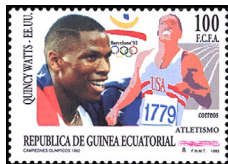
1992 Olympic Gold Medalists A64

Designs: 100fr, Quincy Watts, 400-meter dash, US. 250fr, Martin Lopez Zubero, swimming, Spain. 350fr, Petra Kronberger, women's slalom, Austria. 400fr, Flying Dutchman class yachting, Spain.