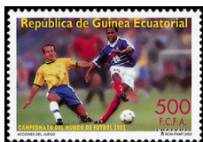
2002 World Cup Soccer Championships, Japan and Korea — A106

2002 253 Horiz. strip of 3 3.75 3.75 a-c. A105 400fr Any single 1.25 1.25