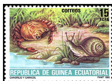
Nature Conservation — A33