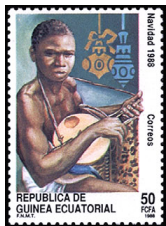
Christmas — A45

1988, June 4 124 A44 35fr shown .25 .20 125 A44 50fr Squares, sphere .35 .20 126 A44 100fr Bird .75 .50 Nos. 124-126 (3) 1.35 .90