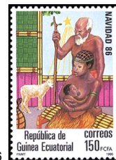
Christmas — A36