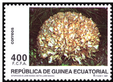
Mushrooms — A85

a, Sparassis laminosa. b, Amanita pantherina. c, Morchella esculenta. d, Aleuria aurantia.