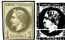
Napoleon III A2 A3