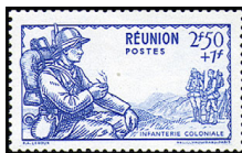
Colonial Infantry SP2

1941 Unwmk. Perf. 13 1/2 B10 SP1 1fr + 1fr red .50 B11 CD86 1.50fr + 3fr claret .50 B12 SP2 2.50fr + 1fr blue .50 Nos. B10-B12 (3) 1.50