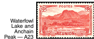
Waterfowl Lake and Anchain Peak — A23