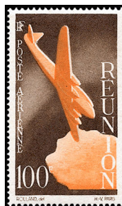
Plane over Réunion — AP6