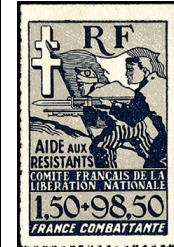
Resistance Fighters — SP1

Catalogue values for unused stamps in this section are for Never Hinged items.