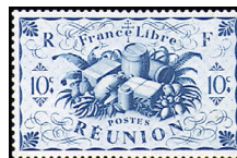
Produce of Réunion A26

Catalogue values for unused stamps in this section, from this point to the end of the section, are for Never Hinged items.