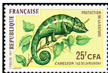
Réunion Chameleon A34

1971, Oct. 18 375 A573 45fr on 90c multi .70 .60 40th anniversary of the first assembly of presidents of artisans' guilds.