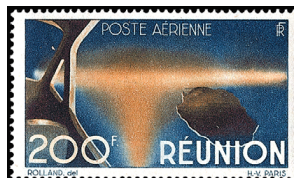
Air View of Réunion and Shadow of Plane — AP7

1947, Mar. 24 Photo. Unwmk. Perf. 13x12 1/2 C32 AP5 50fr ol grn & bl gray 4.00 3.00 C33 AP6 100fr dk brn & org 5.50 4.75 C34 AP7 200fr dk bl & org 7.00 6.50 Nos. C32-C34 (3) 16.50 14.25