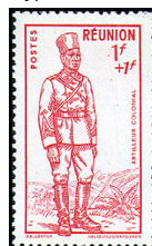
Artillery Colonel — SP1