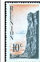
Cliff — A27