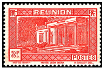
Léon Diex Museum, St. Denis — A24