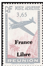
Nos. C2-C5 Overprinted in Black or Carmine

300th Ann. of French settlement on Réunion. Nos. C13A-C13F were issued by the Vichy government in France, but were not placed on sale in Réunion.