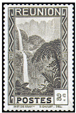
Cascade of Salazie — A22