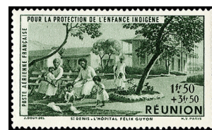
Felix Guyon Hospital, St. Denis — SPAP1

1939 Unwmk. Perf. 13 Name and Value Typo. in Orange CB1 CD83 3.65fr + 4fr brn blk 8.50 8.50