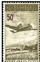
Plane and Bridge over East River AP3