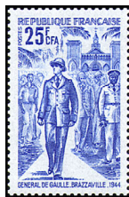
De Gaulle in Brazzaville, 1944 — A35

Designs: No. 377, Gen. de Gaulle, 1940. No. 379, de Gaulle entering Paris, 1944. No. 380, Pres. de Gaulle, 1970.