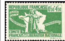
Patriots and Map of France SP3

Surtax for the benefit of French patriots.