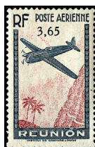
Airplane and Landscape — AP2