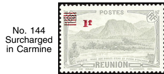
No. 144 Surcharged in Carmine

Nos. 176-177 were issued by the Vichy government in France, but were not placed on sale in Réunion. For surcharges, see Nos. B13-B14.