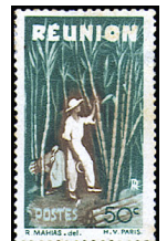
Cutting Sugar Cane — A28