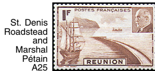
St. Denis Roadstead and Marshal Pétain A25