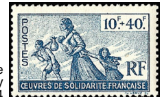
Refugee Family SP4

Surtax for the aid of combatants and patriots.