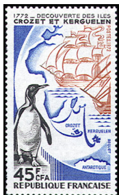
Map of South Indian Ocean, Penguin and Ships — A36

1972, Jan. 17 Engr. Perf. 13 381 A570 50fr on 1.10fr multi .70 .60