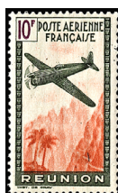
Plane and Landscape AP4

1942, Oct. 19 Perf. 12x12 1/2 C6 AP3 50c olive & pur .20 C7 AP3 1fr dk bl & scar .20 C8 AP3 2fr brn & blk .20 C9 AP3 3fr rose lil & grn .35 C10 AP3 5fr red org & red brn .35