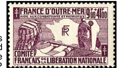
Colonies Offering Aid to France SP2

The surtax was for the benefit of patriots and the French Committee of Liberation. No. B1 was printed in sheets of 10 (5x2) with adjoining labels showing the Lorraine cross.