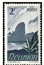
Banana Tree A30