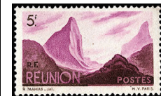
Mountain Scene A31