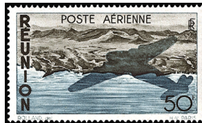
Shadow of Plane — AP5

1946, June 6 C26 CD93 5fr orange .55 .55 C27 CD94 10fr sepia .55 .55 C28 CD95 15fr grnsh blk .55 .55 C29 CD96 20fr lilac rose .65 .65 C30 CD97 25fr greenish blue .70 .70 C31 CD98 50fr green .70 .70 Nos. C26-C31 (6) 3.70 3.70